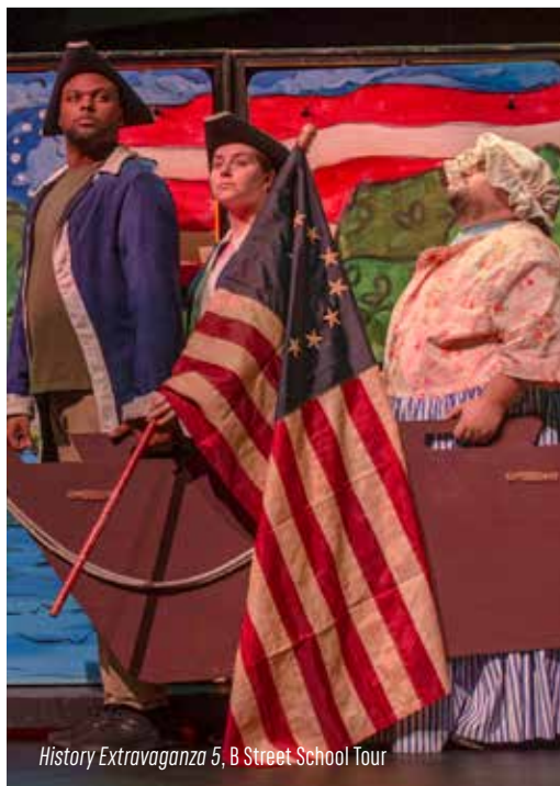
History Extravaganza 5, B Street School Tour

“ STUDENTS AND PARENTS WHO ATTENDED AGREED THAT THE SETS WERE AMAZING, THE SINGING WAS WELL DONE AND THE STORY WAS ENGAGING. I NOTICED MY STUDENTS ON THE EDGE OF THEIR SEATS. ”