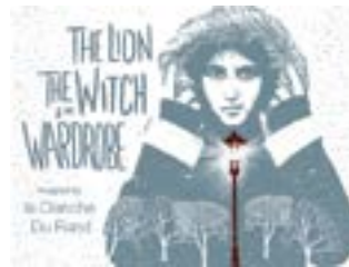
THE LION, THE WITCH, AND THE WARDROBE