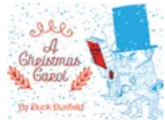
A CHRISTMAS CAROL