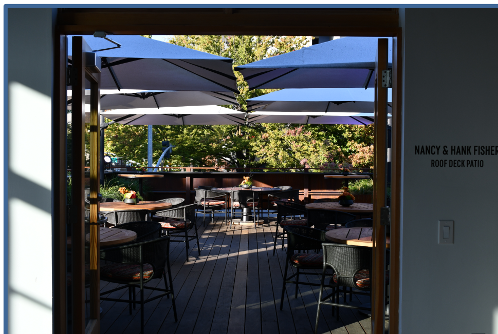
NANCY & HANK FISHER ROOF DECK PATIO